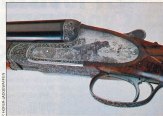
Top of the trade: intricate engraving from Peter Hofer – page 26

Cover: the engravings of Peter Hofer – page 26.