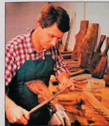
◀ Wooden splendour: the finest materials are used for the stocks

If, on the other hand, you have won the pools, then the address of the maker of this magnificence is: P. Hofer-Jagdwaffen, A-9170 Ferlach, F. Lang-Str 13, Austria. Telephone 010 43 4227 3683.