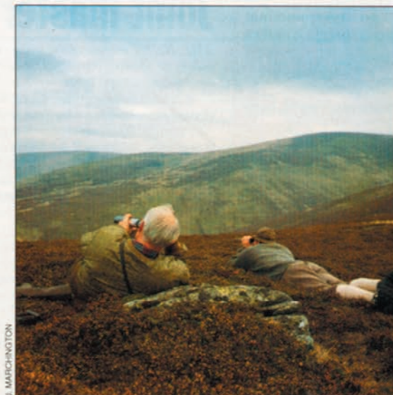
New on the hill? Be prepared for your first days – page 28